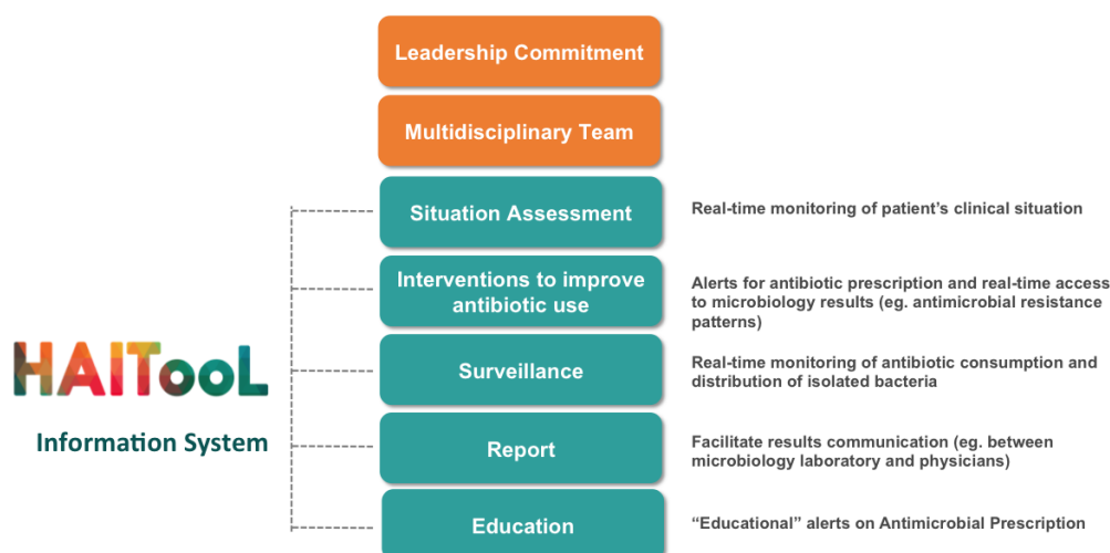
Fig.3 - Key-elements for HAITool ASP [8].